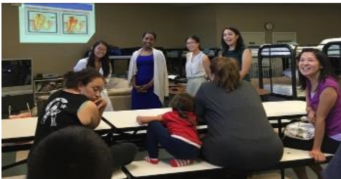
Dental Education at a homeless shelter

Now medical evangelism has taken on a whole new meaning. I've had opportunities to pray with patients, to talk to them about what the love of God has done for me. God has used what I saw as disadvantages to His glory. In spite of my broken Spanish and the fact that I look far younger than a competent dentist, the Lord led me into a conversation on health with one of my Spanish-speaking patients. We began a talk about health, how it impacts our bodies, our minds, and our spiritual growth. I shared books that are precious to me, such as Steps to Christ and others on healthy living. I've spoken to patients about anxiety, health, personal