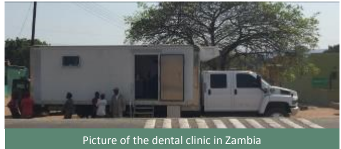
Picture of the dental clinic in Zambia