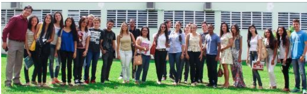
The First Dental class

education, providing to people, the information necessary for them to be responsible for their own oral health. Another planned program is to set up a scholarship fund into which donations can be