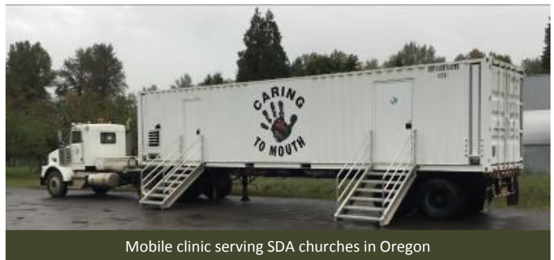
Mobile clinic serving SDA churches in Oregon