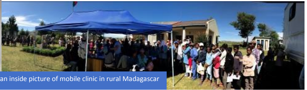
Waiting area and an inside picture of mobile clinic in rural Madagascar

there is one dentist for every 50,000 people. Volunteer dentists are welcome and ICH assists ADRA in coordinating mission trips. Volunteers are responsible for their own airfare, lodging, and food.