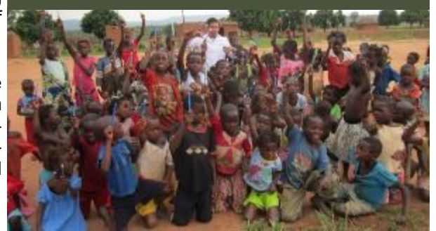
Basic prevention scheme in a village