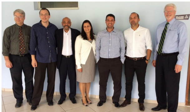
FADBA team visiting LLUSD

The Dental School at FADBA contains a modern facility for dental practice. In 2017 the first of the dental clinics will be inaugurated, a modern surgery center and pediatric clinic, containing a total of 60 consulting rooms. A full service Oral and Maxillofacial Radiology department is also planned for 2018. All of these are available to patients from the community around FADBA and neighboring cities.