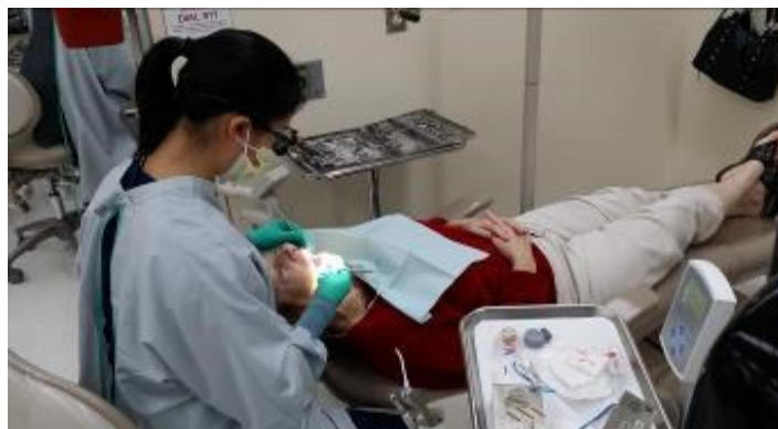
Treating a patient at LLUSD

God was guiding, however, and he led me to think to myself,