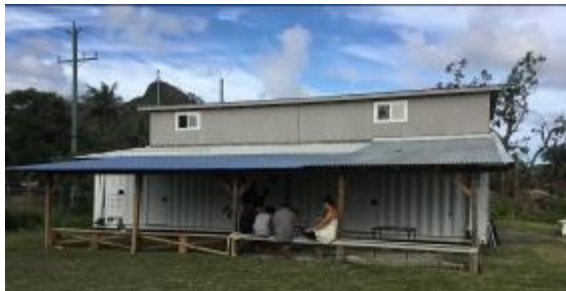
Picture of the clinic in Chuuk after it suffered a direct hit by Typhoon Maysak in April 2015. Two volunteers were safely inside the clinic during the storm.

In Chuuk, Micronesia CHW works with the local Adventist Church and has established a clinic and housing for volunteers. Volunteers, responsible for their own airfare and food, are welcome to stay for free while they serve the people of Micronesia or they can stay in local hotels at their own expense. Volunteers can also enjoy world-class diving in Chuuk, to see many of the Japanese Ships sunk during World War II, as well as revel in the relaxed lifestyle and the beauty of the island.