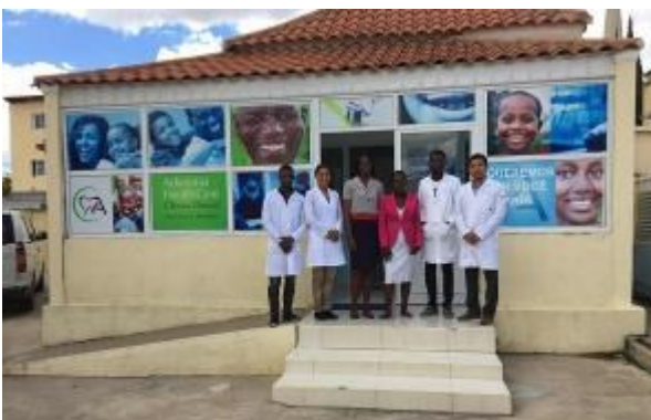
Adventist Dental Clinic of Huambo, 2017