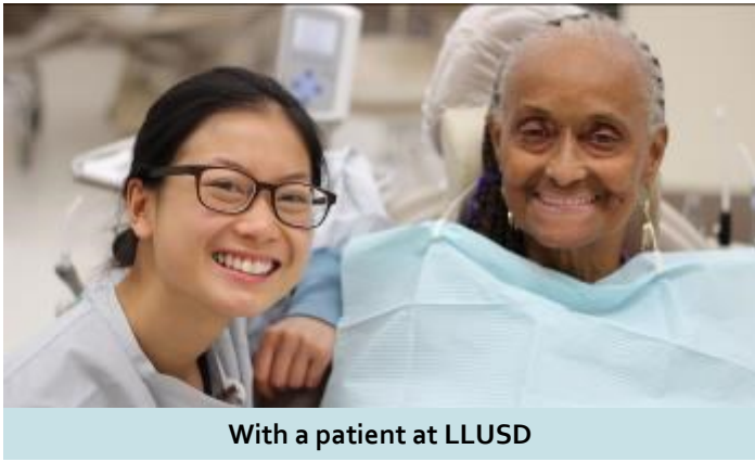
With a patient at LLUSD

"I am an average dental student; yet, I can love my patients with the love of God. Lord, teach me to show them your love." And He did so, in ways that I sometimes resented! I began to have patients assigned to me that had anxiety, who had been shown to be difficult to treat, and who acted badly.