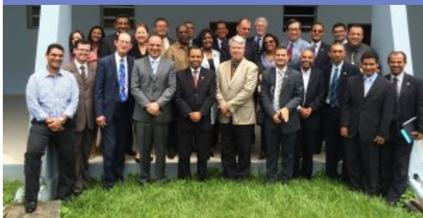
Triple A Commission Site Visit

The expected approval of the dental program came at the end of 2015, only 3 years after its inception! There were many struggles along the way but many people worked to make this new dental school become a reality! The first class, of 60 students, started in February 2016!